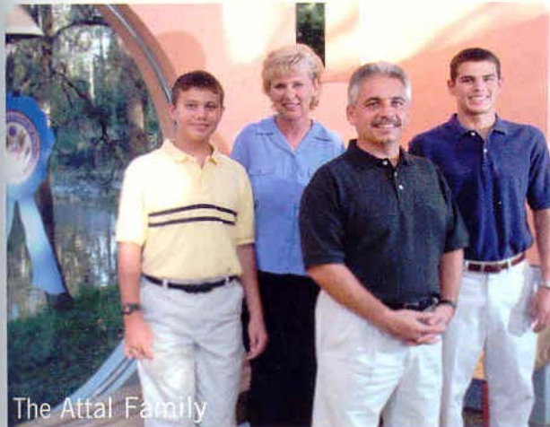
The Attal Family

"By learning in multiple ways, we create a brain-friendly